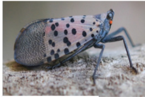
PA Department of Agriculture