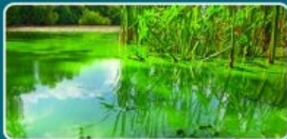
Foam, scum, mats, or paint-like streaks on the water's surface