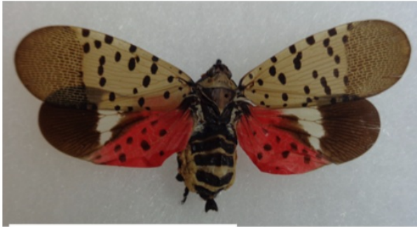
CT Agricultural Experiment Station