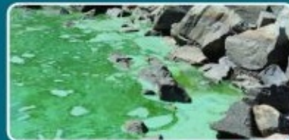
Different colors like green, blue, red, or brown