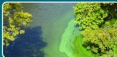
Cyanobacteria bloom more often in summer and fall, but can bloom anytime.