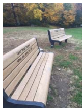
Athletic Field Bench